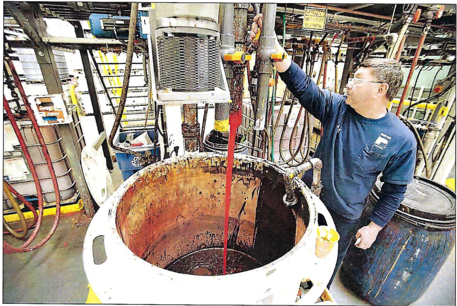
Interprint plans $22M expansion of Pittsfield plant

The terms of the tax agreement allow Interprint to continue paying property taxes at the current assessed property