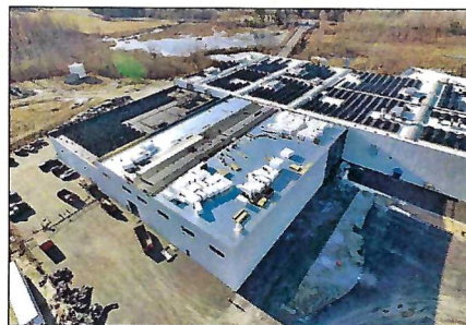
Top: Kevin McLearn mixes colors at Interprint in Pittsfield in 2016. An expansion at the company is expected to create up to 20 new jobs. Above, left: Interprint has secured $22 million in funding to expand its Pittsfield plant.