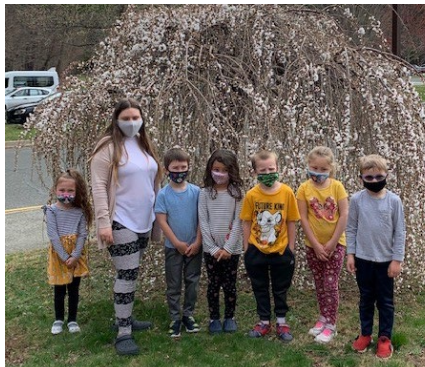
High School internships