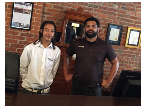
Summer Work Experiences