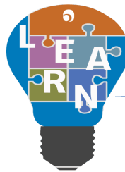
Reflection / Learned Experience